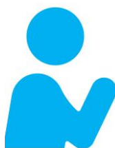
People with underlying medical conditions

Chronic liver disease Cancer Cardiovascular illness etc.