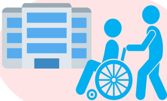
Medical institutions and nursing homes